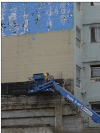
Image-text retrieval is a fundamental step of image understanding in computer vision. Real-world information can be represented as an array of pixels or textual descriptions. Texts and images are the interfaces to access stored knowledge. The image-text retrieval task aims to find the most relevant counterparts of the image-text pairs given either an image or a textual description. Fig. 1 shows an example of an image and its paired textual descriptions.